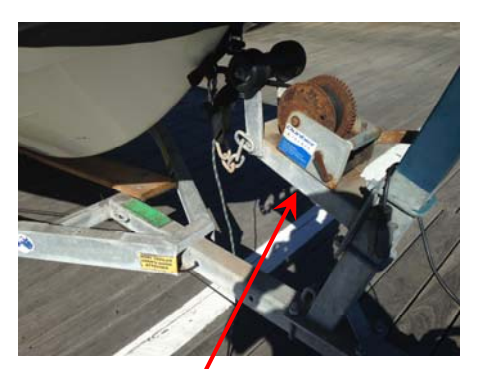
Secondary release cord